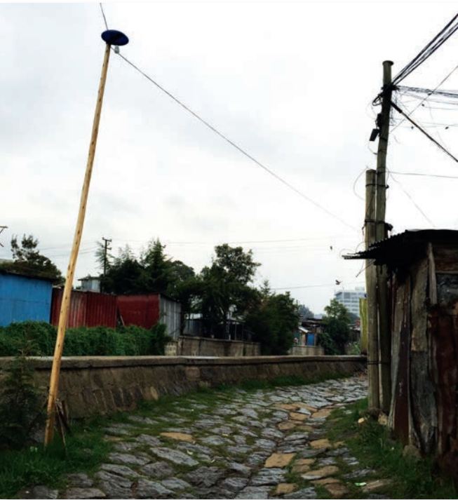
Electric lights and pole installed by community committee for security in WASH project, Addis Ababa.