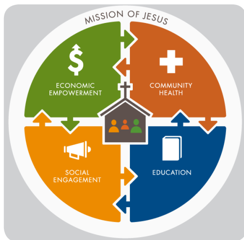
Chart 1: LIA's Transformational Development

After the two day training, the community researchers worked in pairs at the sites, with each pair conducting ten interviews or more. The two principal investigators from the Institute for Urban Initiatives, Grace Dyrness and Karinn Sammann, also visited each of the sites, conducted one to two interviews, and led focus groups at four of the six sites. A total of 67 interviews were conducted and 29 people participated in the focus groups. After gathering the data, all six of the community researchers in each country came together again for data analysis with the Urban Initiatives team.