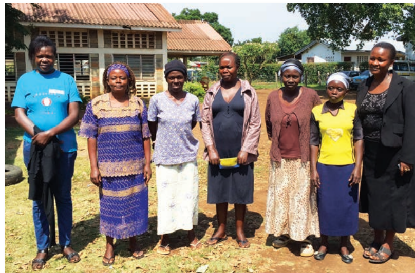
CHEs in Kisumu.