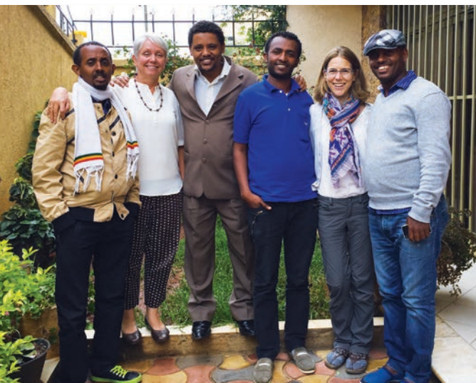
Some of the researchers in Ethiopia

As in any research project, there are certain constraints that limit the conclusions that were found. We mention some here that may have impacted our results.