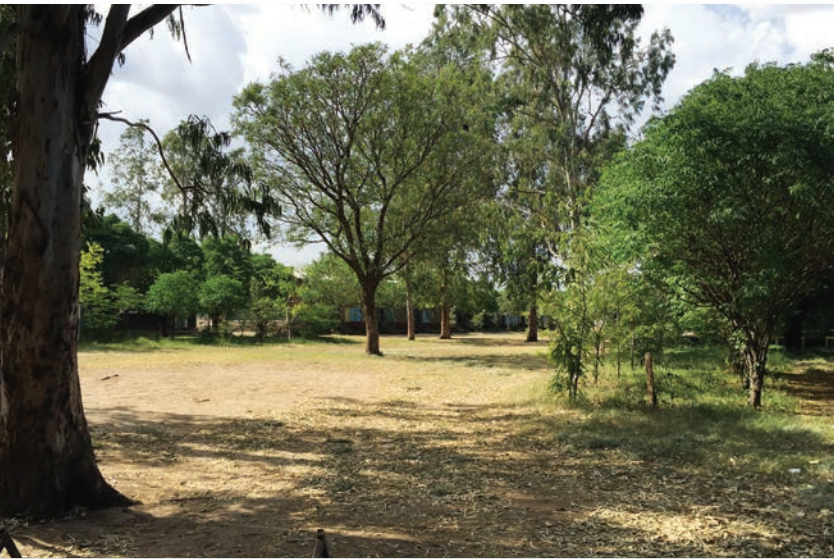
Trees and grass in Green School in Adama.

landscape. Adama is one of the driest areas in Ethiopia and we wondered how it could host a “model green school”?