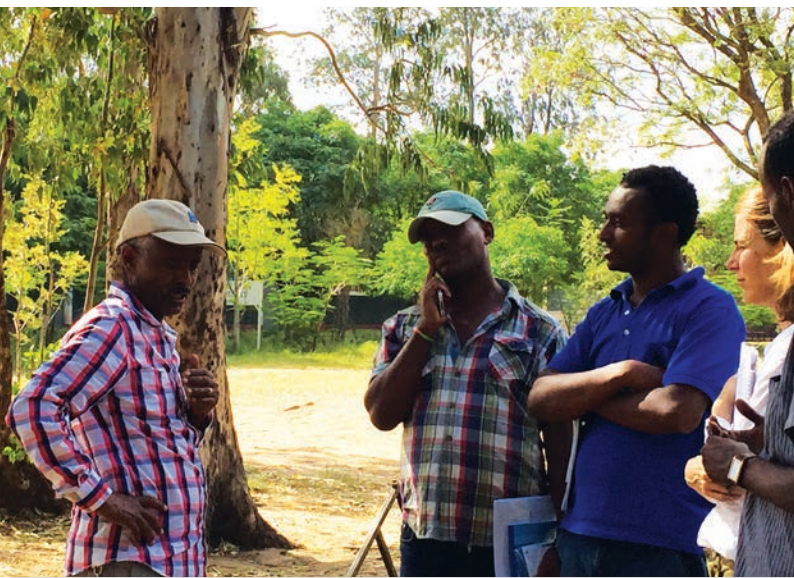
Teacher and researchers at Green School.

At the time of the project, the school created two environmental clubs, each having 7 members, including both teachers and students. These student leaders were responsible for teaching the other students what they had learned in the environmental club and for holding the student body responsible for adhering to these new practices. Upon our visit, three years after completion of the project, 19 teachers and 410 students were currently enrolled in the environmental club!