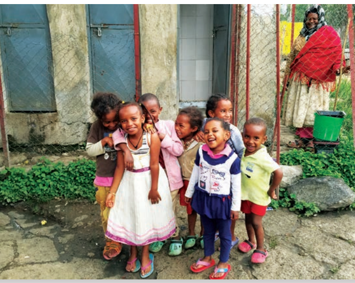
Children and Manager at the showers at the WASH Project in Addis Ababa.

Kirkos sub-city is located in the center of Addis Ababa. The project was implemented in three villages, all marked by high population density and severe poverty. Before the LIA project, people had no method for disposing of rubbish or human waste. Many people used “flying toilets” and would leave garbage on the side of the road. Unsanitary conditions resulted and high rates of diarrhea and other diseases occurred. “K” explained that the dignity and security of the people also suffered. Open defecation occurred at night when it was dark, which was unsafe especially for women and children. The only option for bathing was a river beside the community, which was dirty, and unsuited for the elderly, women and children.