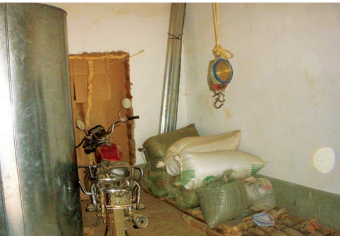
Storage silo and grain in Makueni.

financial management and business training to pursue income-generating activities. Beulah decided to purchase three silos to store grain with its seed capital. The community researched what type of silo would be necessary for their environment. The silos enabled Beulah to not only store their own grain during the dry season, but also purchase grain from other community members at low cost during the harvest. The ability to store grain provided a source of both food and income during the driest times, because they could sell the stored grain at peak prices when food shortages occurred.