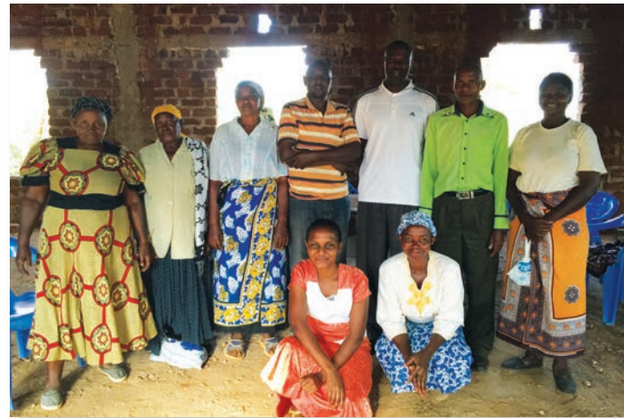
Members of the Beulah Savings and Credit Association.

The members were eager for us to know the meaning of Beulah, which comes from the book of Isaiah and stands for “The land will not be desolate again”. When LIA came to Makueni, a partnership of 11 pastors was established who identified food and water security as the community’s most pressing issues. In coordination with LIA, a plan was developed to install tanks at participating churches to harvest and store water during the rainy season and distribute it for free during the dry season. In addition, several table-banking groups 12 , such as Beulah, were provided seed capital, as well as