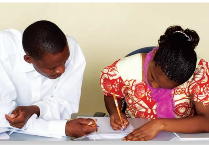
Community Researchers in Makeni working on interview protocol.

• Selection of community researchers. The participatory aspect of this research project dictated that the community researchers come from within the community, something that was accomplished here, but they had to have enough education and English language capacity in order to work with the principal investigators who did not speak their languages. As a result we may have omitted members of the community who would have been key to further research and strategic planning within the community. We especially felt the language restrictions in Ethiopia where even our selected researchers struggled with English. Nevertheless, we were grateful for the level of commitment of each of these researchers and of their effective communication within their communities.