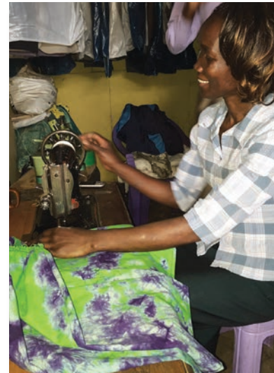
Woman tailor in Kibera