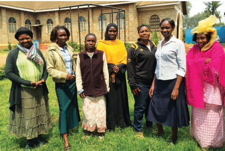
Community Health Educators in Kibera, Kenya.

It was a cold morning and the quiet room in the back of the health clinic began to come alive as the CHEs arrived. They greeted each other with warm welcomes. One woman held her baby in a brightly colored cloth slung across her chest. You could feel the energy as they entered. We listened carefully as each woman, and one man, began telling their stories.