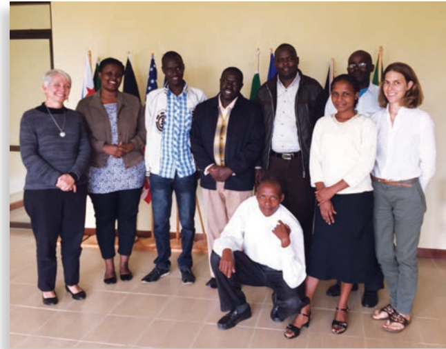
Kenya research team.