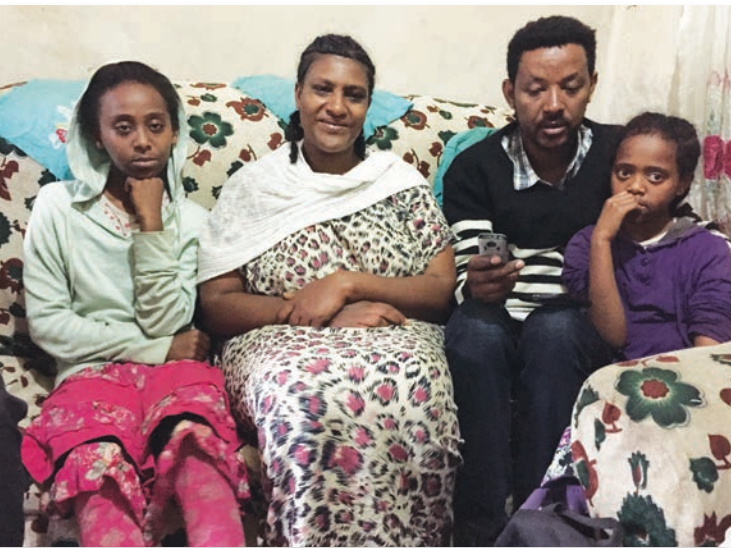
Community members share stories at Emmanuel.

speak. Another spoke about the difficulty of living with her alcoholic husband. And another was a single mother of three girls. No doubt these women's lives are challenging.