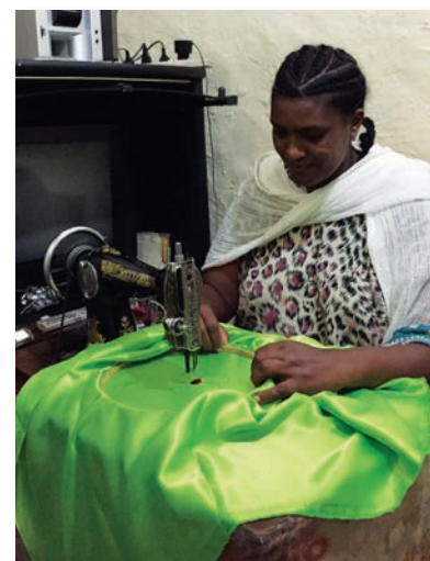
Woman using her newly acquired skill. She has bought her own machine.