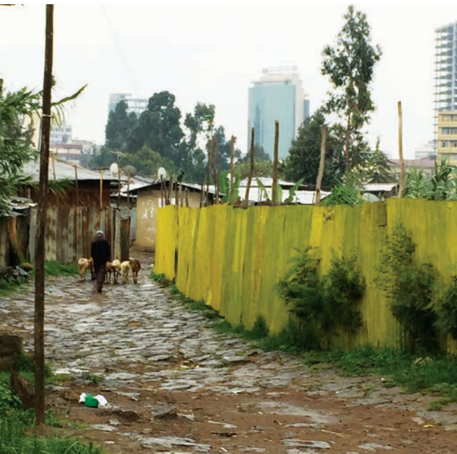
The wall the community built to keep out hyenas at the WASH project, Addis Ababa.