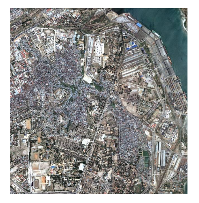
Above: Colour orthophoto (60cm resolution) of Dar es Salaam, Tanzania. Dense and complex structure of unplanned housing is clearly distinguishable from planned residential and industrial development. Individual buildings can be identified and counted.