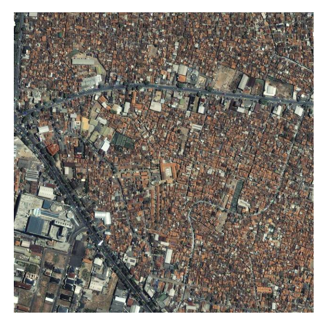
Above: Ikonos image(1m) of Kalyan-Dombivli, India. Slum areas can be distinguished from planned developments but individual buildings cannot be distinguished