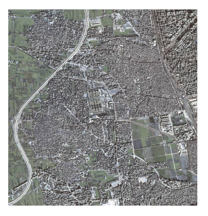
Above: Ikonos image (1m) of Cairo, Egypt. Extensive, high density, multi-storey unplanned development. Public infrastructure and services lag behind development. Some pockets of agricultural land remain but are under high development pressure.