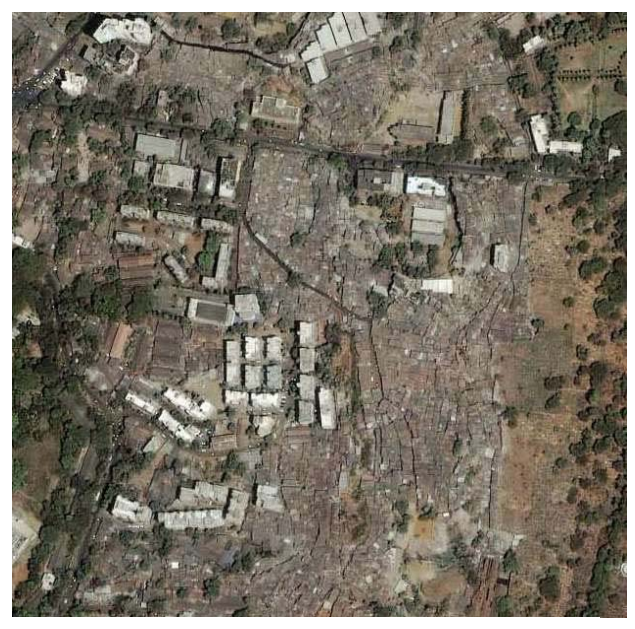
Above: Ikonos image(1m) of Bandung, Indonesia, showing very compact and complex settlement patterns mixed with regular, planned development