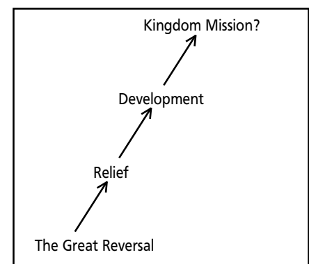
Figure 1: YWAM's Journey to Kingdom Mission.

YWAM is currently working on a statement of what discipling the nations and realizing the Kingdom might look like. While this is very much in process, we think it is in large part about the transformation of individual lives, communities, cultures and the earth. It has to do with realizing God's intentions for people and the earth. It is God-centered. It is about realizing shalom and seeing redemption in every aspect of life. It is about justice for all people. It is about destroying the powers of darkness, wherever they are found.