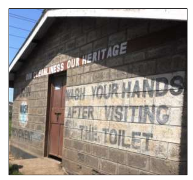
FIGURE 8 - No Water to Wash Hands

Three schools used "pour-flush" toilets, but two of them reported regular water shortages, leading to dirty or smelly toilets. One student stated, "The toilets are the kind you are supposed to pour water down to flush but there is no water! So the feces just sits there and never gets flushed." Comparatively, a student at a school that reported having enough water described what she liked most about her school's toilets, "They are always clean. I like that you pour water down them so it removes the waste so they are not smelling."