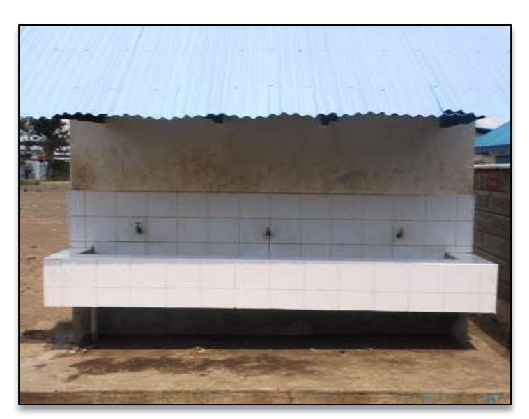
FIGURE 14 – The Effect of a Title Deed (Water): The image on the left shows the school's bathing room for students; the image on the right shows the school's washing area. Both are made possible by a direct, low-cost connection to the city's water supply thanks to a title deed.

The results of this study expose the fact that sanitation solutions cannot be effective unless the issue of land is considered. When schools lacked land and land security, they were apprehensive or fearful to build permanent sanitation facilities for fear of demolition, or they simply had no space to build. Therefore, a permanent solution to land for slum dwellers will mean that girls will be more likely to access to safe, private, gender-sensitive, adequate facilities in their schools. According to the city's own water supplier, Nairobi City Water and Sewage Company, "Provision of basic services and improved quality of living will have a more positive impact on the poor if it involves a holistic approach that improves their legal situation" (NCWSC, 2009, p. 14).