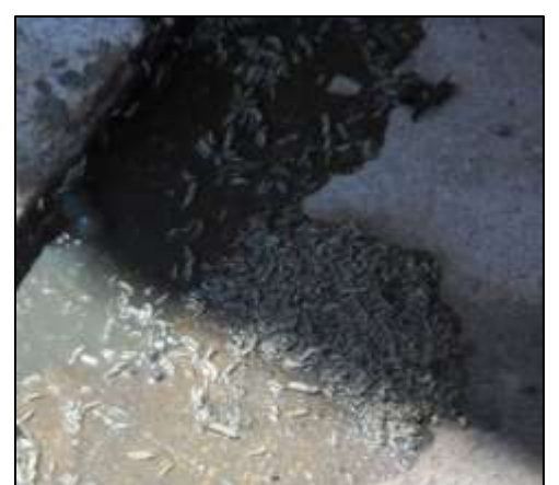
FIGURE 12 - Maggots and Leaking Sewage

At another school, the head teacher explained, "Drainage is one of the biggest problem. Let's talk of April – I wish I could show you what I saw. The water that has flooded all over that place. Even the water comes up to the classrooms. In fact, children, their legs are in that water. And truly is not even clean water. It's water that has been splashed from the sewages, from all over." Several teachers explained that the latrines would flood and overflow onto school grounds during the rainy season. "You find when it rains now the water tries to come up through the toilet and it spills away, out, causing a disaster to the community."