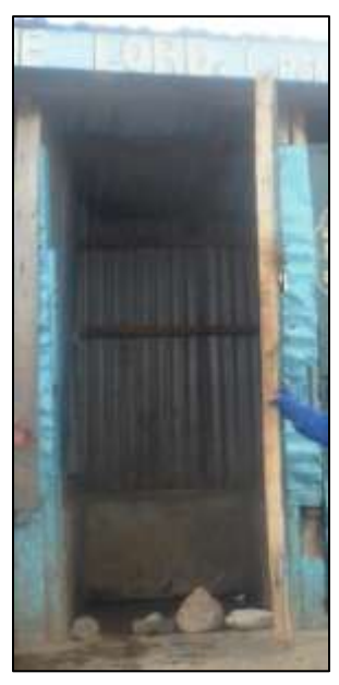
FIGURE 6 – Using Rocks for Privacy

At the majority of schools, girls reported shame, embarrassment and fear while using the toilet because of a lack of privacy. One young woman explained, "Someone can see inside the toilets. You try to get the one that doesn't have so many holes; you must be careful which toilet you choose." Figure 6 shows stones that female students placed at the bottom of the toilet door at one school, in order to cover a large gap where the boys could peek in at them. At another school, the girls' toilet had no door on it at all, though the boys' toilet had a door with a lock. One of the pupils reported, "The boys can peep at us when we are using the toilet. We feel so embarrassed and ashamed."