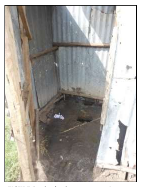
FIGURE 5 - Gender Separation in a Latrine

Only four schools had toilets that were either physically separated or had a large, secure barrier between the girls' and boys' toilets, while eight did not.