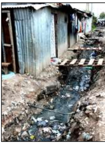
FIGURE 11 – Sewage Lines on School Grounds: The image on the left shows a sewage line covered with boards passing through the center of a school's play area; the image on the right depicts a sewage line near the entrance of a school.

At another school, the head teacher explained, "Drainage is one of the biggest problem. Let's talk of April – I wish I could show you what I saw. The water that has flooded all over that place. Even the water comes up to the classrooms. In fact, children, their legs are in that water. And truly is not even clean water. It's water that has been splashed from the sewages, from all over." Several teachers explained that the latrines would flood and overflow onto school grounds during the rainy season. "You find when it rains now the water tries to come up through the toilet and it spills away, out, causing a disaster to the community."