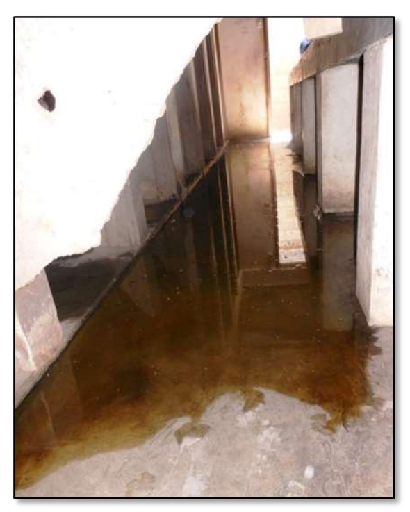
FIGURE 10 - Urine on the Floor

Human waste could be seen around many of the latrines, and in a few schools the waste was overflowing. The toilets at one school appeared to be in good condition from the outside as they were made of stone, but the teachers that accompanied the research team refused to enter. The smell was overpowering, and upon entering, researchers saw a teenage girl emerging from one of the stalls whose feet splashed through a half inch of urine that covered the entire floor. Figure 10 shows the urine on the floor.