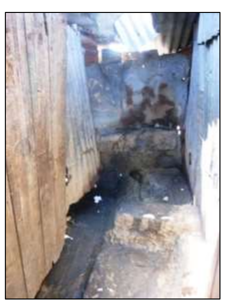
FIGURE 9 - No Space to Build Toilets

When asked about why the school had problems with their toilets, one teacher responded, "We are located in the slums where there is not enough land – space. The big problem is that the space is not there." Another stated, "When you look the compound is too small. The space is too small." However, some of the schools did have enough space. One teacher explained, "Yeah the space is there. Space is not a problem for us."