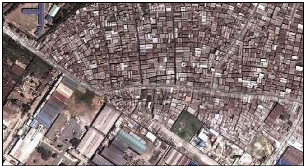
FIGURE 2 – Aerial View of Mukuru: This image, captured by Google satellite, shows the density of Mukuru slum. The industrial area that borders the slum (where many of its residents are employed) can be seen in the bottom left corner.

Mukuru borders Nairobi's industrial area where the majority of its residents are employed (COHRE, 2008, p. 107). While many of these industrial companies operate with multi-million dollar annual budgets, they employ thousands of low-wage workers who are unable to afford housing and goods outside of informal settlements. Mukuru, a Swahili word for "dumping site," is home to the industrial area's waste disposal location which has been known to contaminate community water and land (COHRE, 2008, p. 108). Most of the homes in Mukuru are ten foot by ten foot, single-room shacks made of perforated iron sheets or mud. The slum's density is estimated to average 318 households per acre.