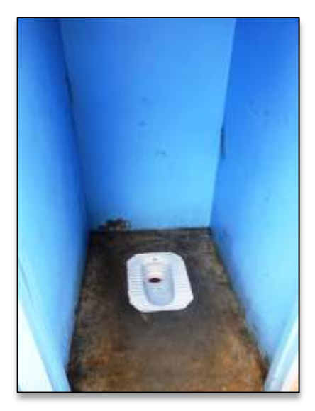
FIGURE 13 – The Effect of a Title Deed (Toilets): The image on the left shows well-constructed, gender-segregated toilets at the one school in this study with a title deed; the image on the right shows a close up of a toilet at the same school.