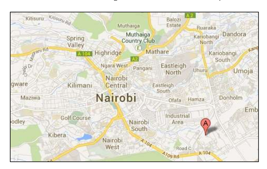
FIGURE 1 - Map of Nairobi: The star indicates the location of Mukuru slum.

The focus of this study is Mukuru slum in Nairobi, one of the largest informal settlements in East Africa. Mukuru is located 10 kilometers outside the city center. The unofficial and ever-evolving nature of the slum makes it nearly impossible to determine Mukuru's exact population, but it is estimated to be somewhere between 600,000 and 700,000 people. The massive slum is divided into eight "villages," with the two largest being Mukuru kwa Reuben and Mukuru kwa Njenga. In order to narrow the research focus, these two villages were selected as the subjects of this investigation.