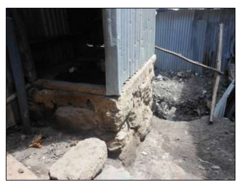
FIGURE 7 - No Door on the Girls' Toilet

Figure 7 shows the school toilet with no door. The structure behind the toilet is someone's home, and there is no barrier between the school toilet and the rest of the neighborhood. Furthermore, this particular toilet is located on the edge of